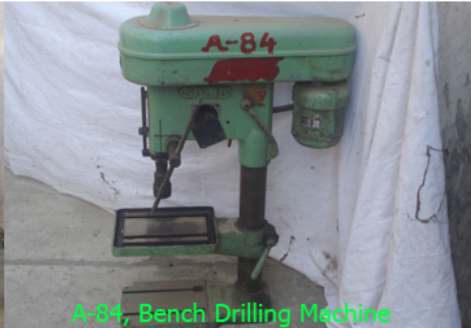
A-84, Bench Drilling Machine