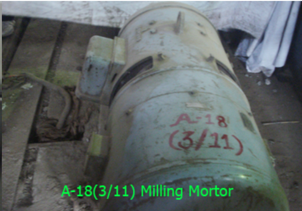
A-18(3/11) Milling Mortor