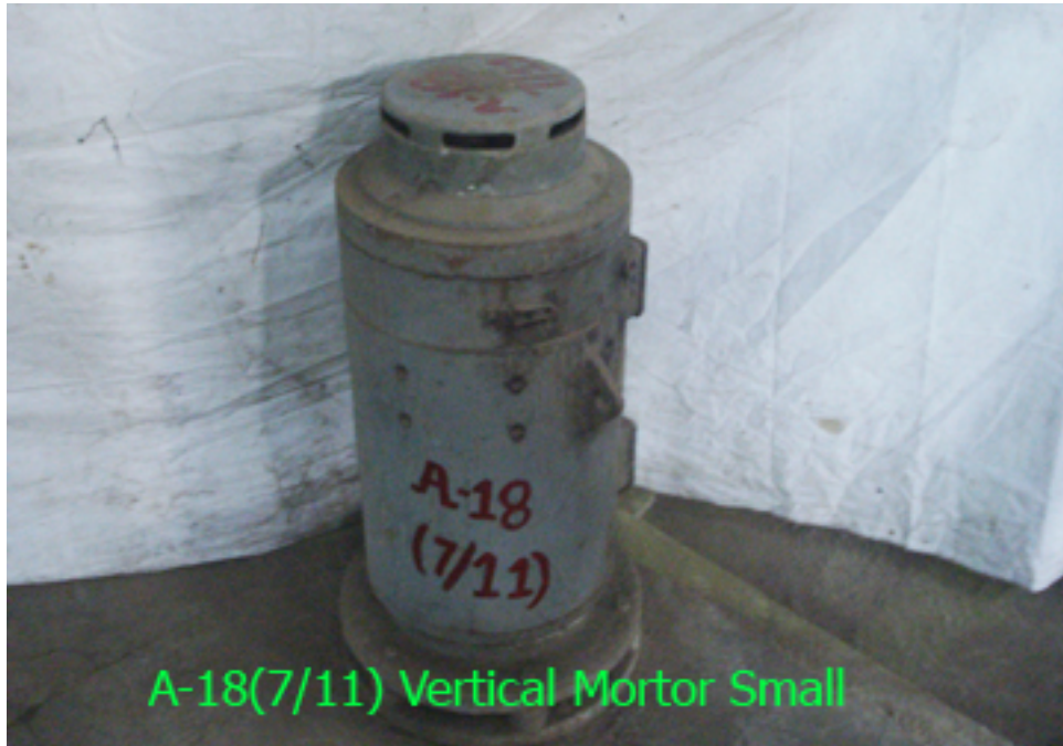
A-18(7/11) Vertical Mortor Small