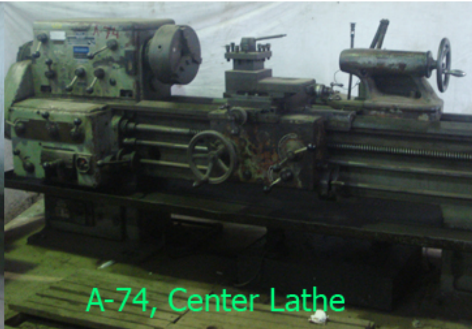
A-74, Center Lathe