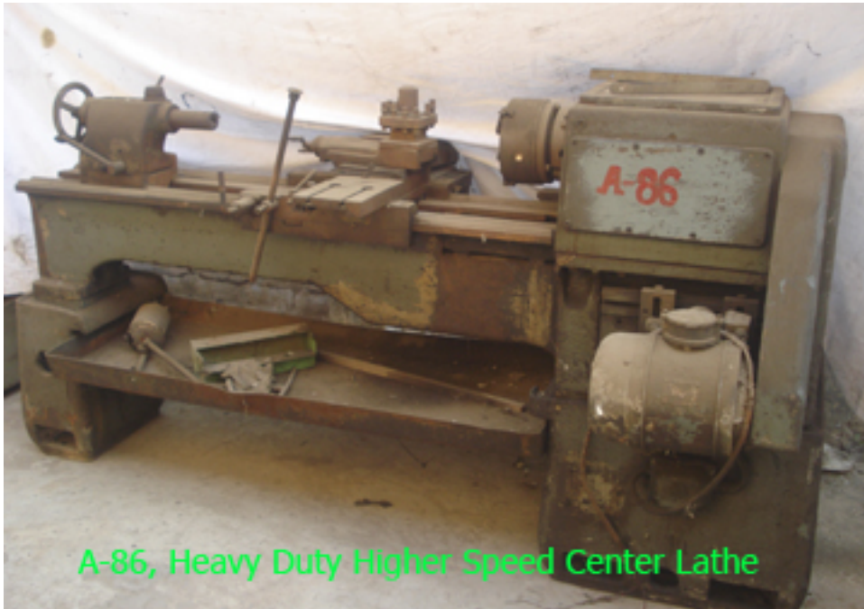
A-86, Heavy Duty Higher Speed Center Lathe