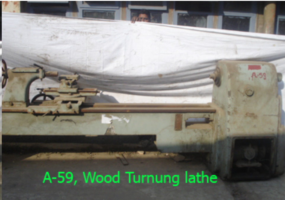
A-59, Wood Turning lathe