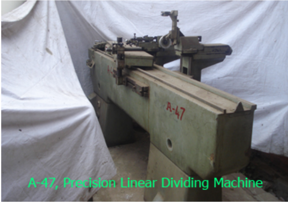
A-47, Precision Linear Dividing Machine