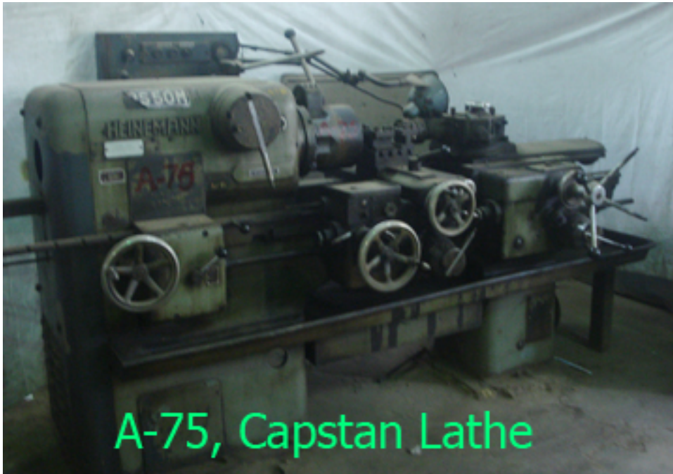
A-75, Capstan Lathe