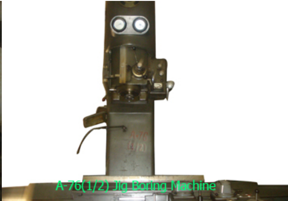
A-76(1/2) Jig Boring Machine