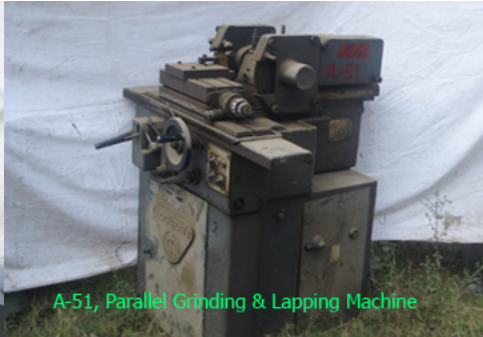
A-51, Parallel Grinding & Lapping Machine