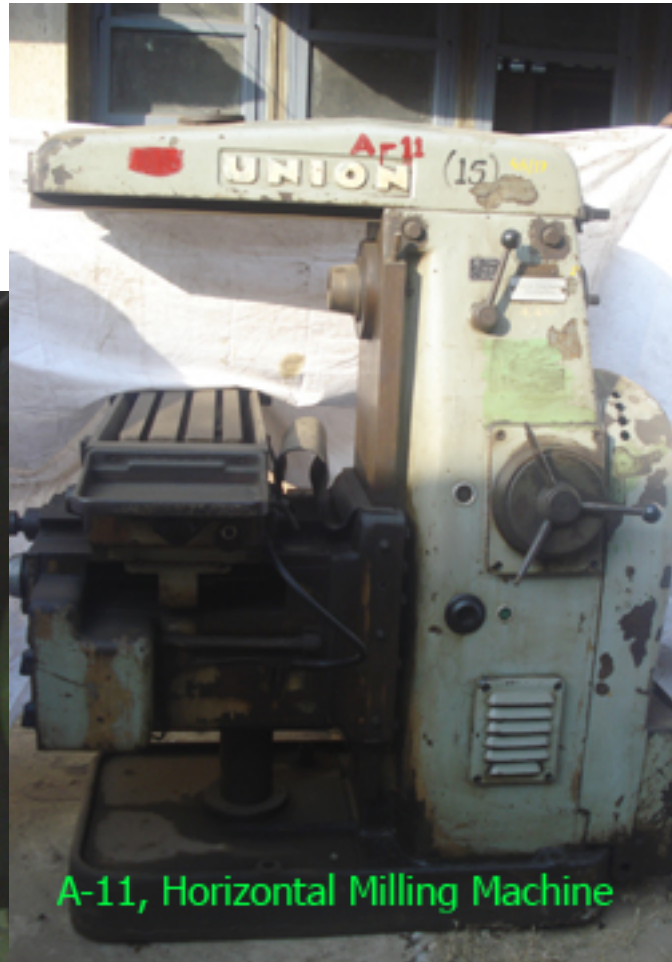
A-11, Horizontal Milling Machine