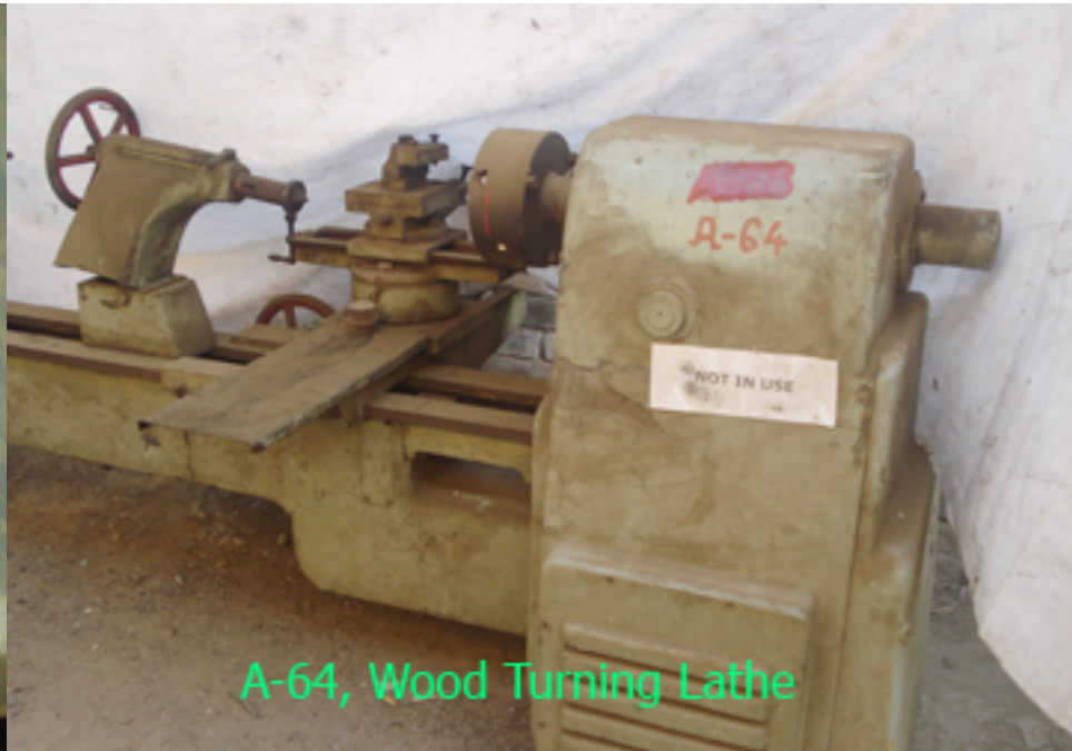
A-64, Wood Turning Lathe