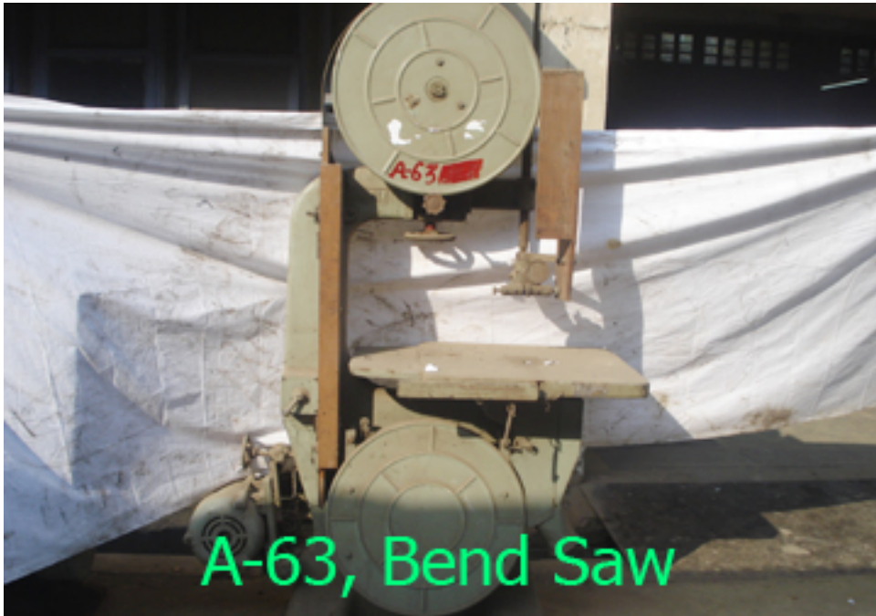
A-63, Bend Saw