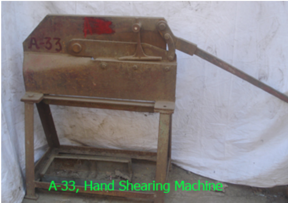
A-33, Hand Shearing Machine