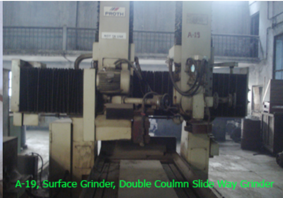
A-19, Surface Grinder, Double Column Slide Way Grinder