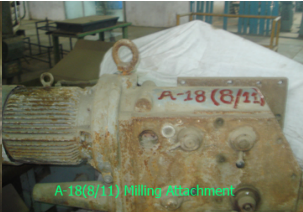
A-18(8/11) Milling Attachment