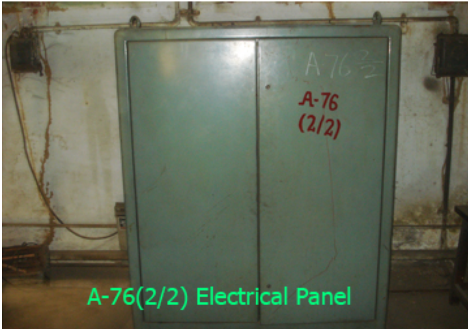
A-76(2/2) Electrical Panel