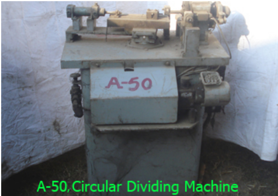
A-50, Circular Dividing Machine