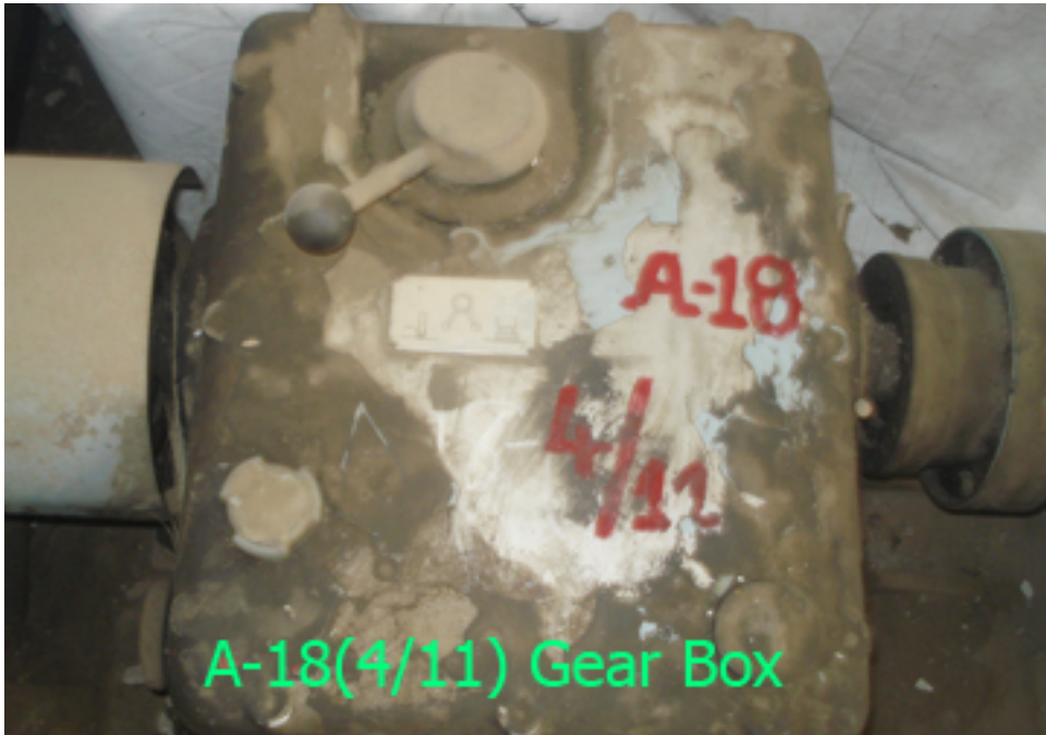
A-18(4/11) Gear Box