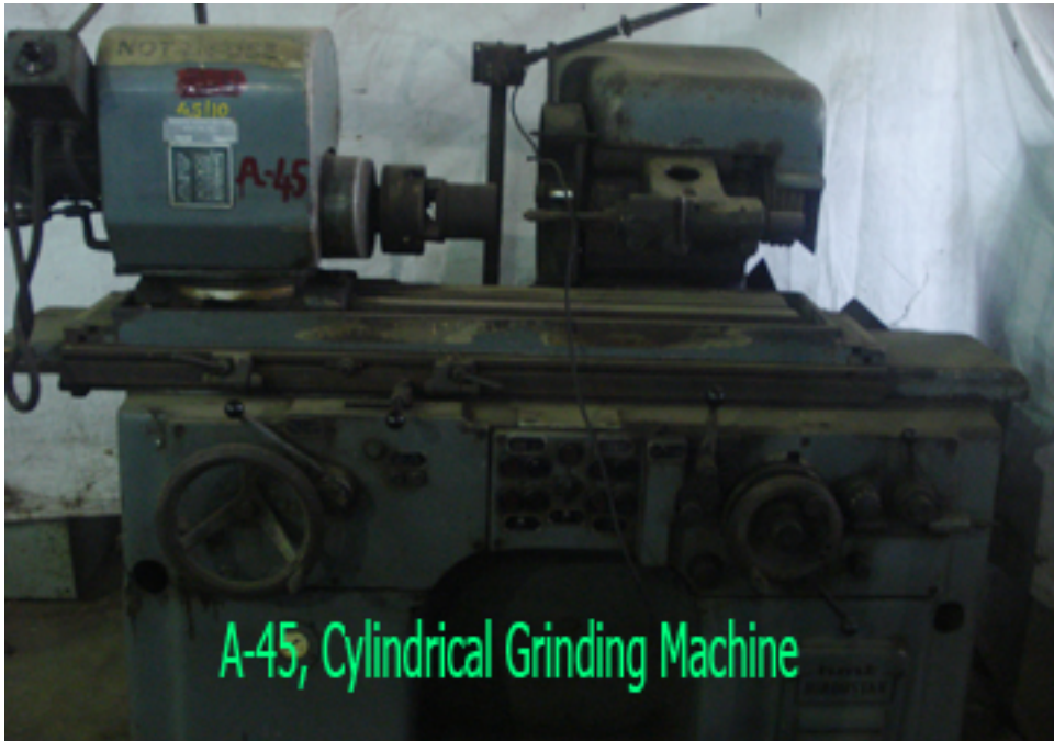
A-45, Cylindrical Grinding Machine