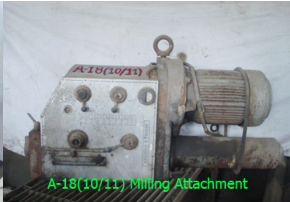
A-18(10/11) Milling Attachment