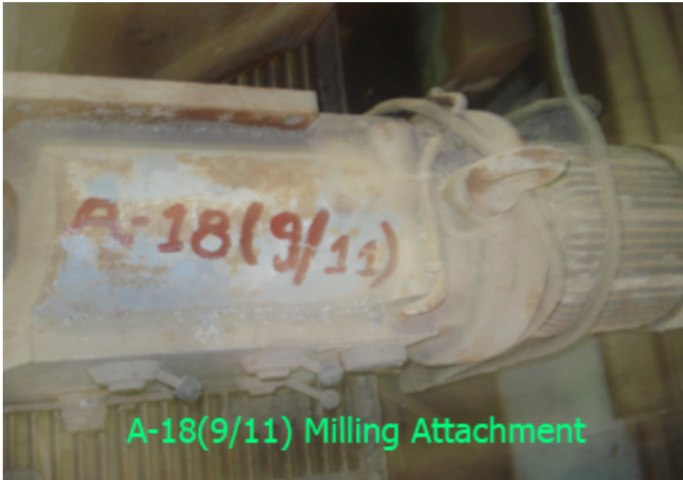
A-18(9/11) Milling Attachment