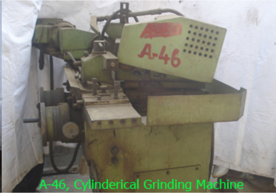
A-46, Cylindrical Grinding Machine