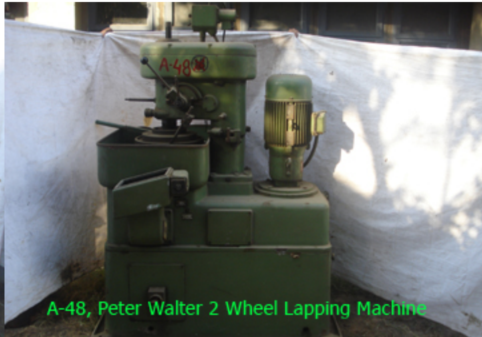
A-48, Peter Walter 2 Wheel Lapping Machine