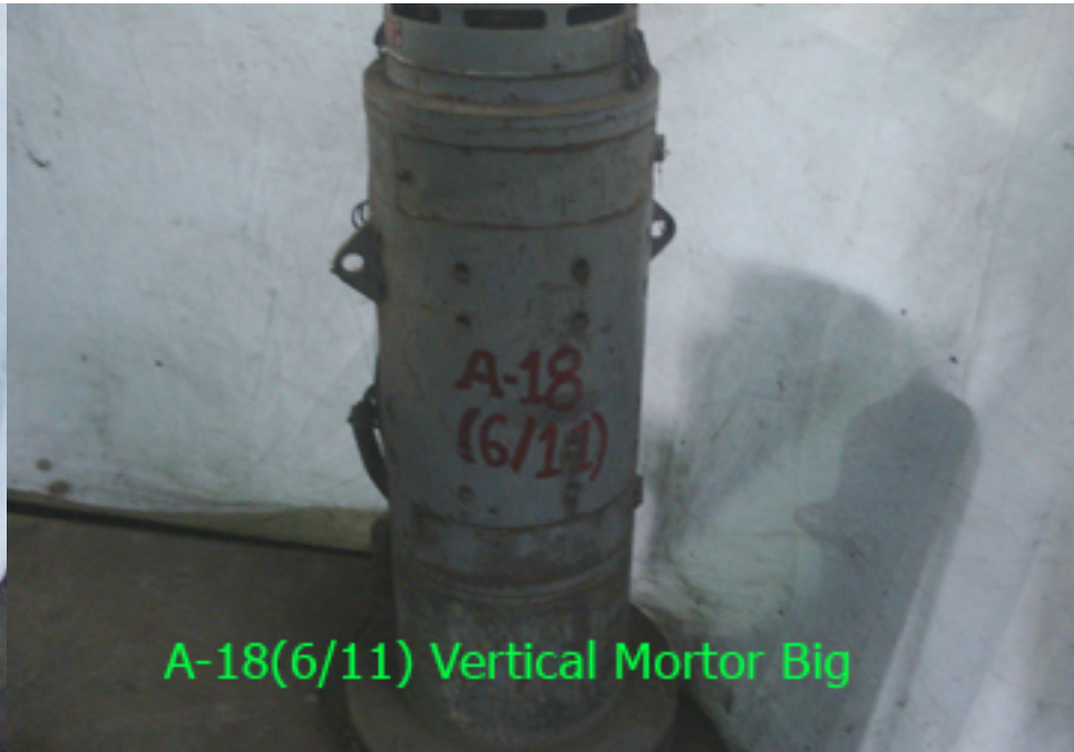
A-18(6/11) Vertical Mortor Big