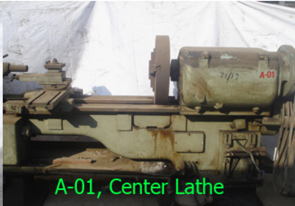
A-01, Center Lathe