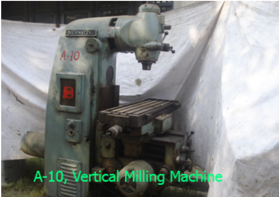
A-10, Vertical Milling Machine