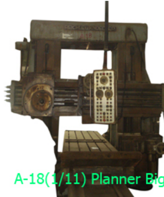
A-18(1/11) Planner Big