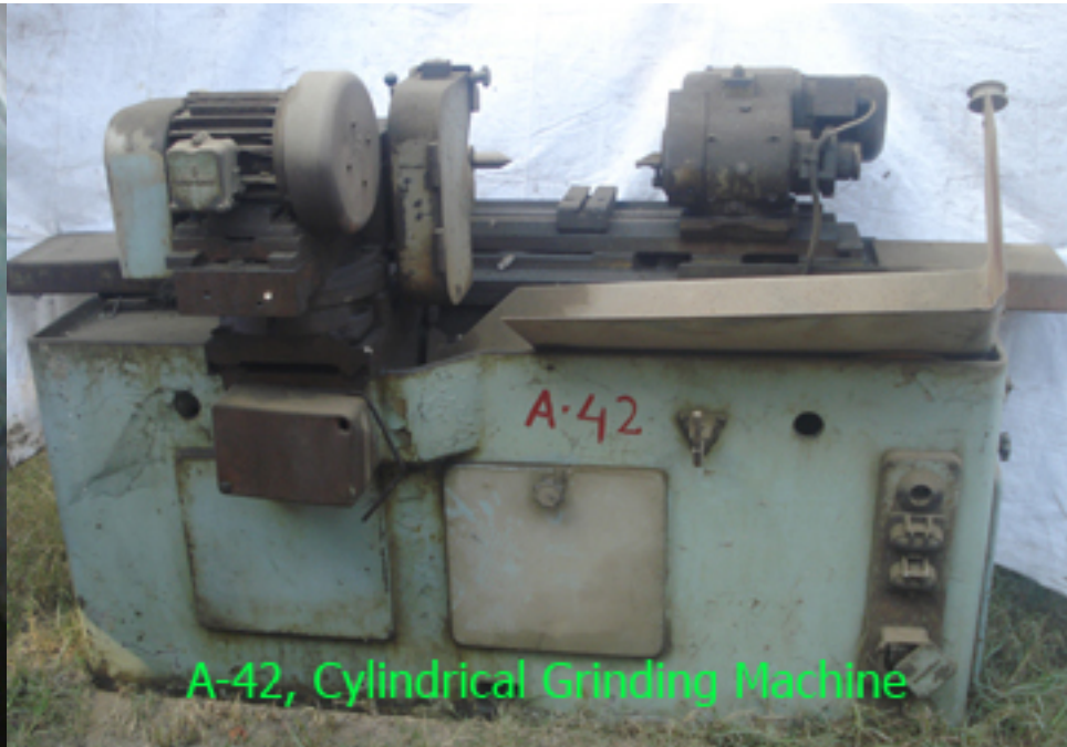
A-42, Cylindrical Grinding Machine