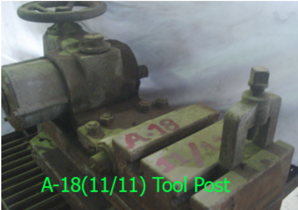
A-18(11/11) Tool Post