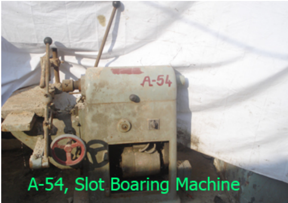
A-54, Slot Boaring Machine