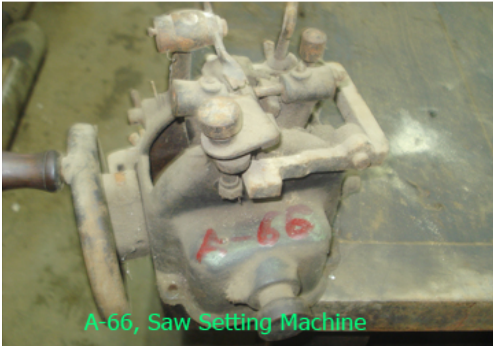
A-66, Saw Setting Machine